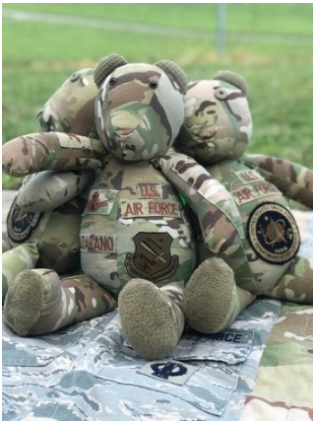
Figure 1. Teddies by "Quilts and Crochet by Jonna" on Facebook